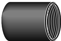
NPS Straight Tapped Threads * = NPT Taper Pipe Threads