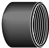
Filetage NPS * = filetage NPT