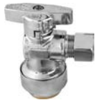
VALVES - PUSH-FIT